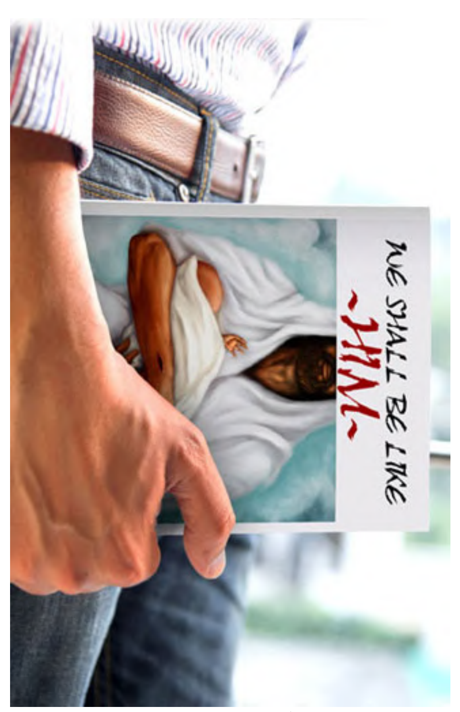
We Shall Be Like Him Copyright 2017/2020 LJM