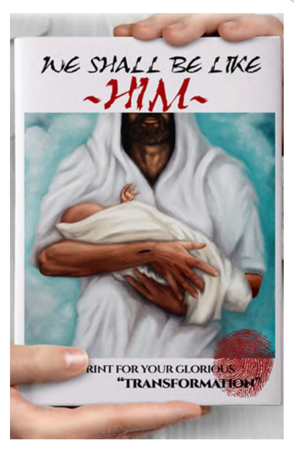
We Shall Be Like Him Copyright 2017/2020 LJM