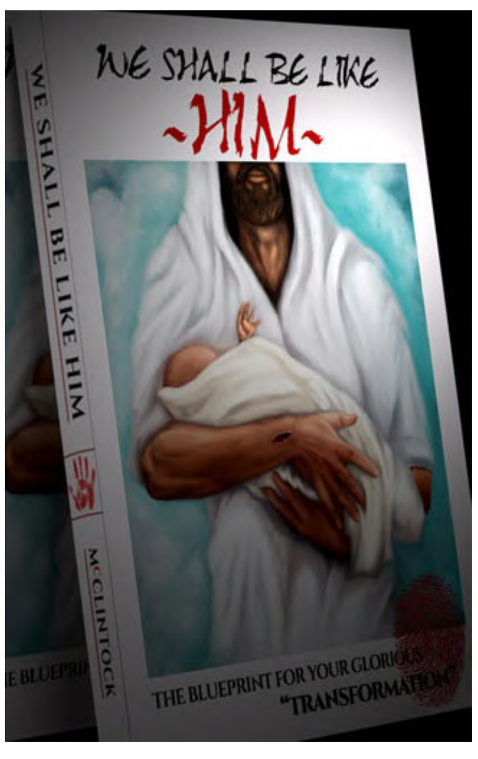
We Shall Be Like Him

"How then will they call on him in whom they have not believed? How will they believe in him whom they have not heard? How will they hear without a preacher? And how will they preach unless they are sent? As it is written: 'How beautiful are the feet of those who preach the Good News of peace, who bring glad tidings of good things!"' (Romans 10:14-15 WEB)