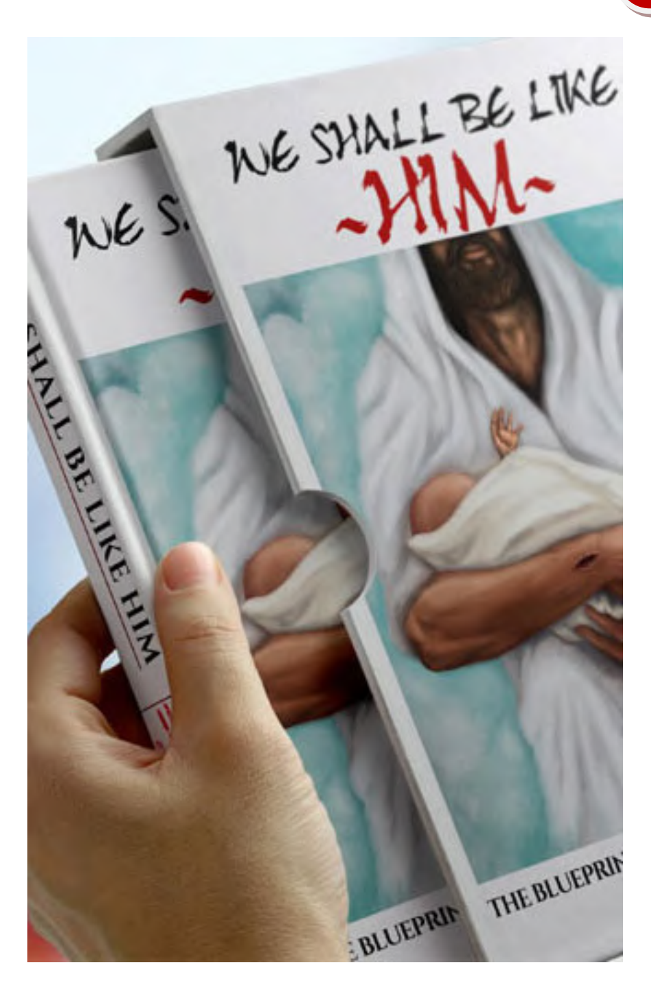
We Shall Be Like Him Copyright 2017/2020 LJM