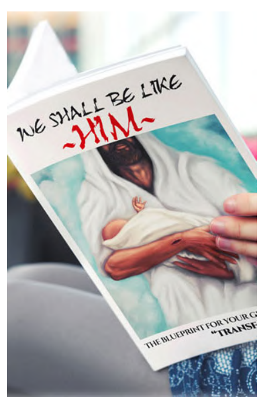
We Shall Be Like Him Copyright 2017/2020 LJM